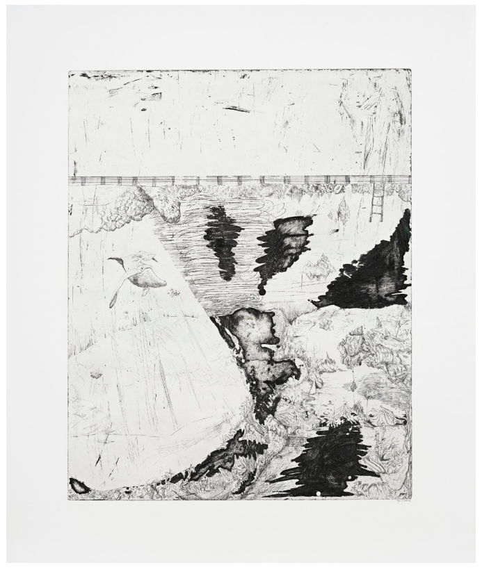
Flukten The Great Escape, 2013 / 2017 Intaglio 139 × 118 cm (framed)

Ragna Misvær Grønstad's main body of work is situated within an aquatic landscape drawn figuratively and expressively, using printmaking techniques such as woodcut and intaglio. The Imaginarium – as she refers to it – is where she connects all forms of art praxis. Here we find an imaginary aquatic flora and fauna, with tiny traces of human interference. Yet the atmosphere within this aquatic environment refers more to the cosmos and nebulas than the deep blue sea.