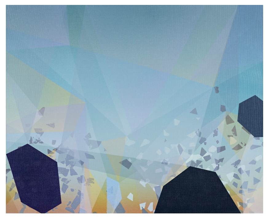
View I, 2018 Serigraph, hand colored, on canvas 65 × 80 cm