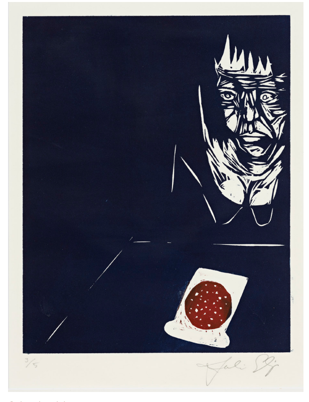
Salamibrødskive Slice of bread with salami, 2015 Woodcut, edition 5 63,5 × 51 cm (framed)

The core of Julie Ebbing's artistic practice is woodcut. She combines this technique with installations, sculpture, embroidery, collage, found objects, performance and text. Ebbing injects raw energy into her graphic works. She is able to exploit the uniqueness of the woodcut technique within its given framework while at the same time creating new contexts. She draws on art history, and offers both political and social commentary in her works. Ebbing's artistic practice is both relevant and innovative in terms of the medium and its thematic focus.