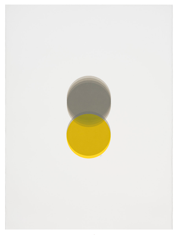
Komposisjon gjennom sirkel gul/grå. Composition through circle yellow/grey, 2018 Serigraph, edition 10 84 × 64 cm (framed)

Per Kristian Monsås works with issues connected to depictions of three-dimensional form in a two-dimensional medium. The basic principles of this investigation is layering and color. The small circles, slightly deflected from a perfect overlap, creates optical illusions. Pigments, layering and arrangement construct possibilities for an exploration on how shape, size and colors relate to one another, giving the illusion of a three-dimensional space.