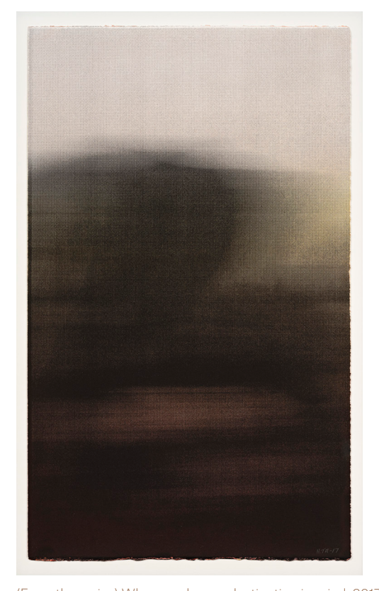
(From the series) When you have a destination in mind, 2017 Serigraph, airbrush, edition 2017 no. 2 85 \times 54 cm (framed)

Hedvig Thorkildsen explores the connection between photography and printmaking. Landscape photographs are the starting point for her graphic art in the series "When you have a destination in mind". Through serigraphy she reworks the photographic material with different colors and techniques, the theme and processes circles round conditions of change and movement in the landscape. Thorkildsen searches for a force in the graphic impression that is related to photo and video works.